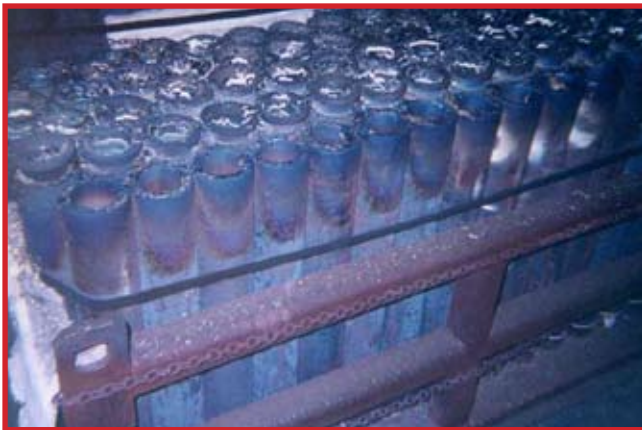
Heat sizes to 10+ tonnes