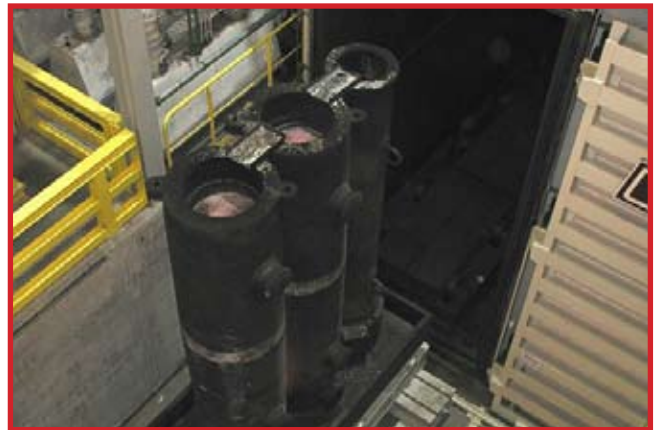
Heat sizes to 30+ tonnes